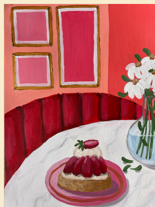
La Patisserie 1931 Strawberry Tart