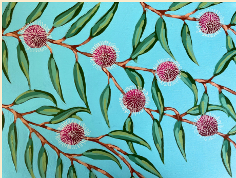
Pin Cushion Hakea