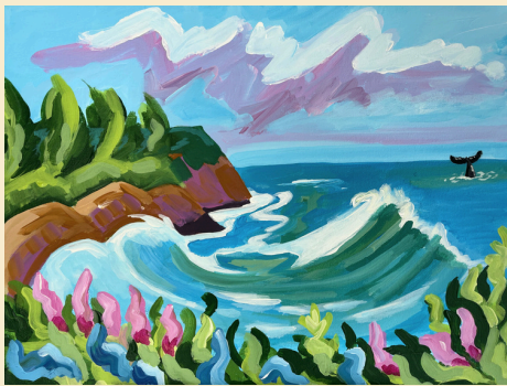
Whales & Waves