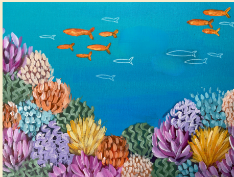
On the Sea Floor